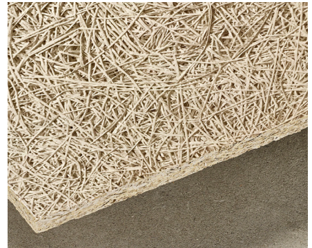
Regular 3 mm Wood Wool Strand Width