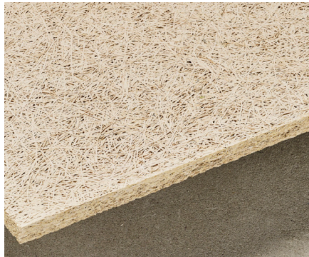
Fine 1.5 mm Wood Wool Strand Width