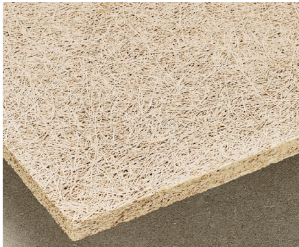
Superfine 1 mm Wood Wool Strand Width